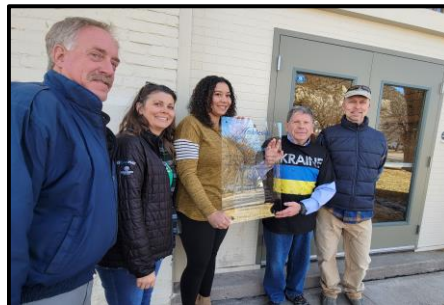
The Town's donation of the front doors to the Ambleside School was recognized with a plaque.

SATURDAY, MAY 7 TH RACE STARTS AT 9:00 A.M