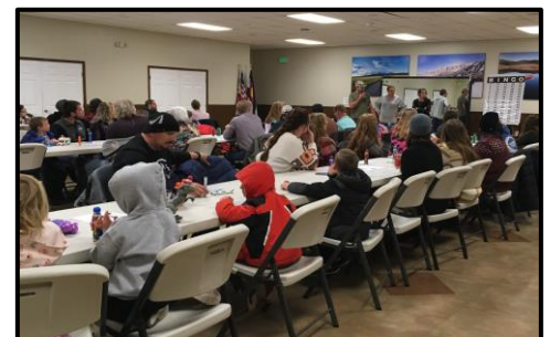
Another successful Bingo night on March 10 th was called my Colorado Drifters.