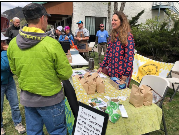
Earth Day events at City Market had an excellent turnout, in spite of the weather.

Sign up now at newcastlechamber.com and look for more details in the June Newsletter.