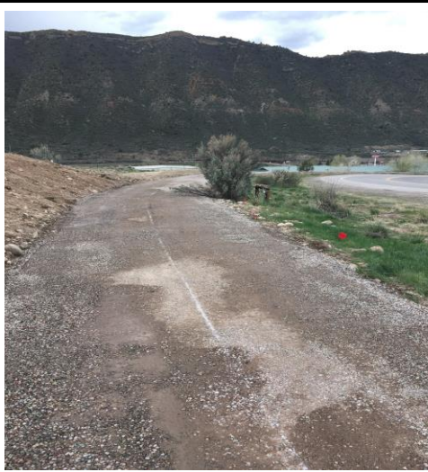
Town of New Castle Public Works is busy building a trail from the Shibui Apartments to the City Market Plaza.

Finally, Symphony in the Valley returns to present "Symphony Swing" on Saturday, May 7, at 6:30 pm at New Hope Church. The concert is the Symphony's annual fundraiser and features Big Band music from the Roaring Twenties, with dancing and dinner catered by Stoney Joanie's.