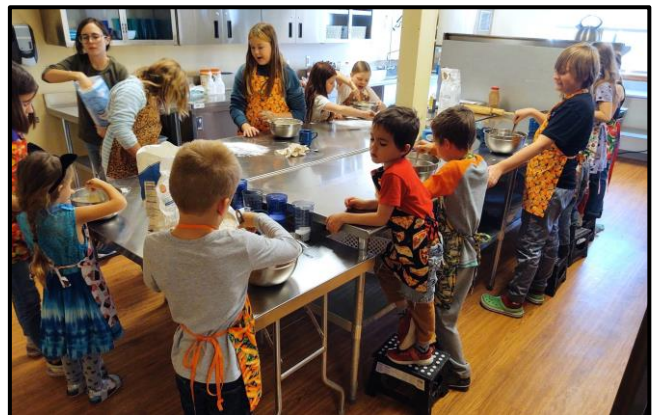
Fall Activity Days young participants making use of the newly remodeled kitchen at the Community Center.

Little Hoopers Basketball (K-2nd grade) Saturdays in January at 10 am.