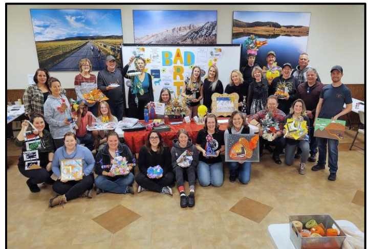
Bad Art Night was a huge hit once again! Thank you to New Castle Recreation for holding this event year after year.

The Roaring Fork Valley First Responders Spouse Support Group is for those who may be stressed by changing schedules and routines and lets them know they are not alone. Visit RFV First Responders Spouse Support on Facebook for information about monthly meetings.