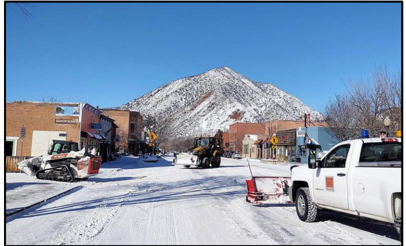
Public Works Department teaming up to remove snow from Main Street.

Finally, as spring approaches, please help the bees by letting dandelions flower. Dandelions are one of the first sources of food for bees. Wait until the blossoms wilt, then remove them before their seeds blow.