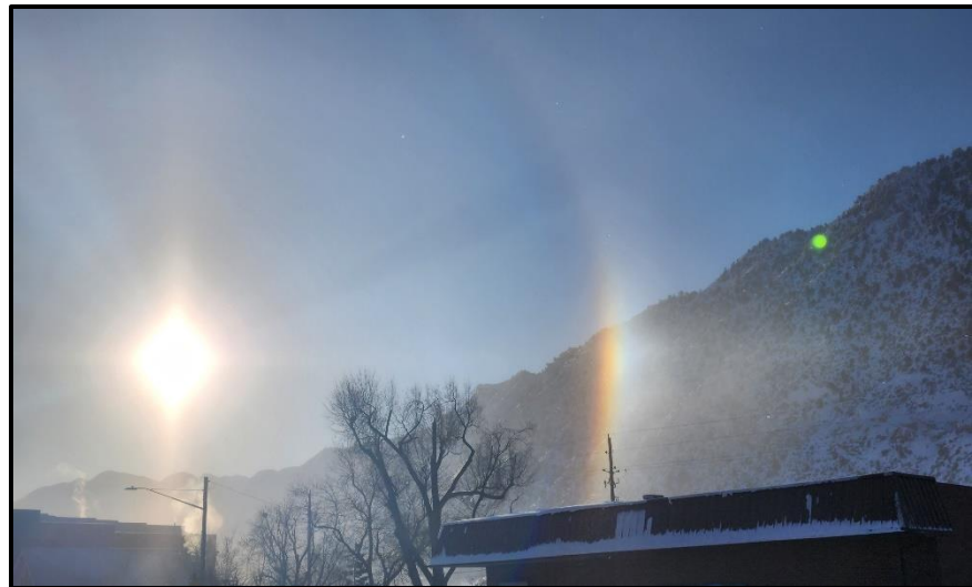
Ice rainbow formed on a cold February day in New Castle.

A full schedule of Earth Day activities will appear in the April newsletter.