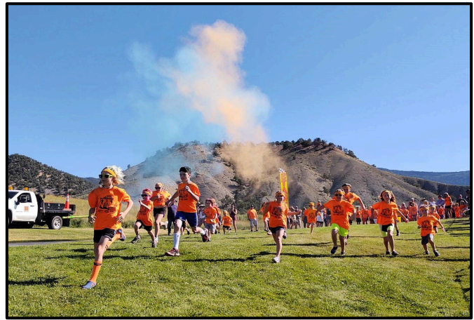
Photos from July’s Dirty Hog Dash and grand opening of the New Castle Dog Park.