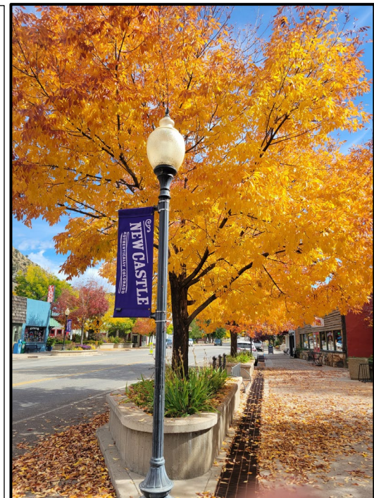
Downtown New Castle boasting beautiful fall colors in October.

It's everyone's enthusiasm and creativity that continues to make New Castle's Halloween celebration a cherished new tradition. Look for photos on the Visit New Castle Facebook page.