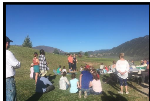
The Cub Scout/New Castle Recreation Fishing Derby at Alder Pond on May 8.