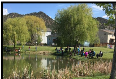
Cub Scouts and friends at the Arbor Day tree planting in Alder Park on April 30