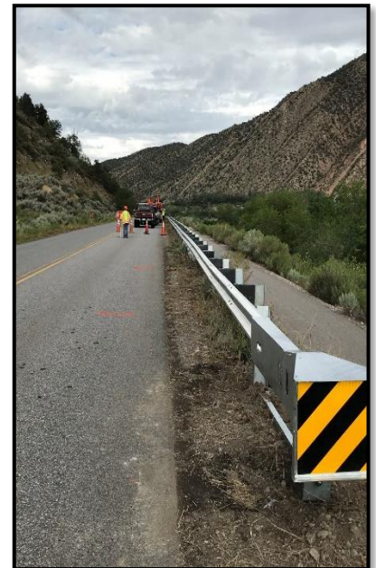
The guard rails along 335 Road have been replaced thanks to a grant from the Colorado Department of Transportation.